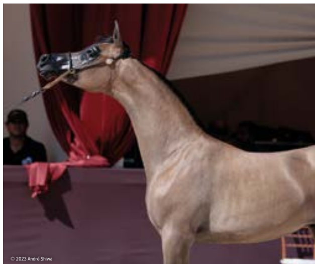
Silver Jr Jr Filly - RD Nyanna

The winner of the Gold Junior Junior Colt title was Azzam Serondella, a beautiful bay son of Quasim CRH and out of HDF Varsóvia yet another daughter of HDF Lugano. The Silver Champion Domenico FWM paved the way for his brother and sisters who later won classes and championships on behalf of their sire Dominic M. His mother Nahla el Madan is by El Tino and also produced the twice-National Junior Champion Filly My Best Surprise FWM, by Bandit SRA. Evoke, a son of National Champion Stallion Vivaldi Al Shawan, took home the Bronze.