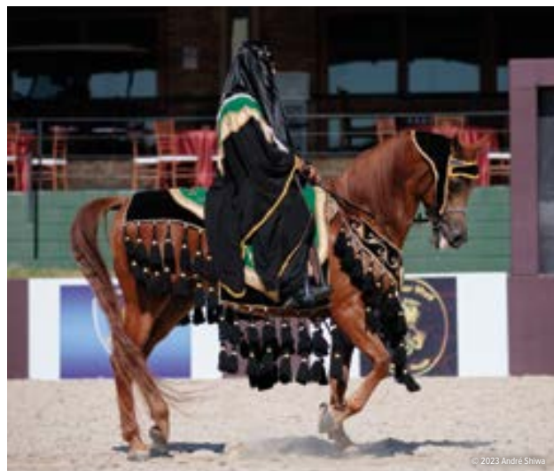
Champion Open Hunter - 3rd Open English - 3rd Open Native - Zdyor JM