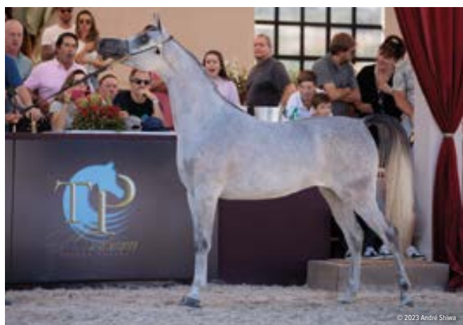
Silver Filly - My Best Surprise FWM