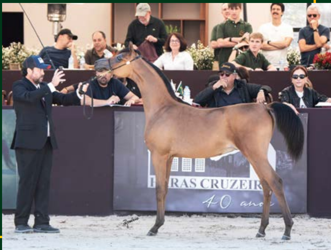
Gold Jr Jr Colt - Azzam Serondella