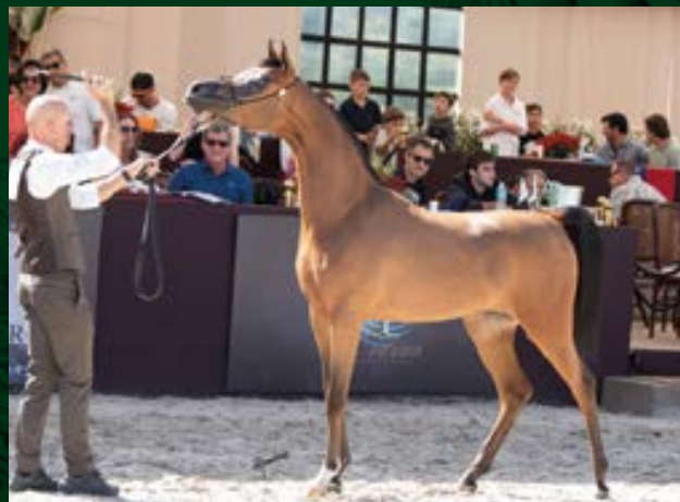
Bronze Jr Filly - HDF Fantastica