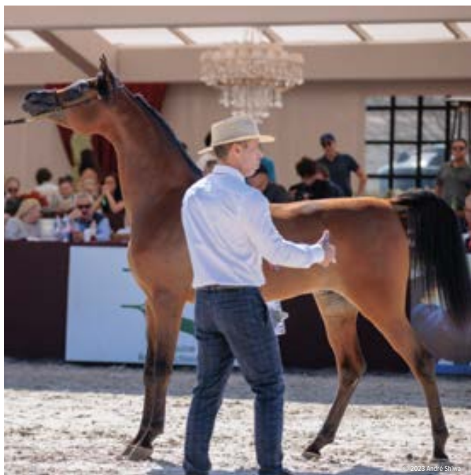
Gold Young Colt - Keanu LA