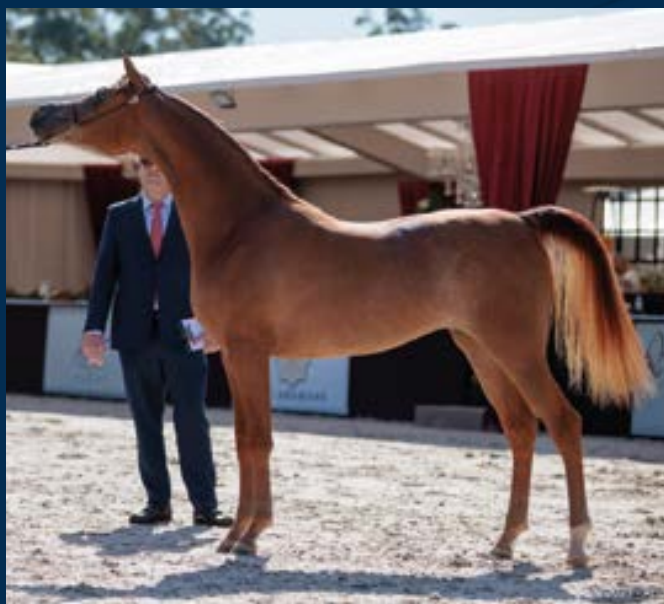
Gold Junior Filly Brazil Cup - Saryanna HVP

In the Junior Colt division the Gold went to Sir Lucius FWM (Wandan el Madan x Lady Alice FWM) bred and owned by Haras Lone Star. The Silver Champion Hexxalt di Terjoi JM, bred and owned by Haras JM, is by the Argentinean sire HCE Terjoy who was on lease in Brazil for only two years and out of the great Stig Justhine, one of the farm's most important mares. Haras JM also won the Bronze with Hyann di Vaalente JM (*Vaalente x Tzarinna D'Pscore JM).