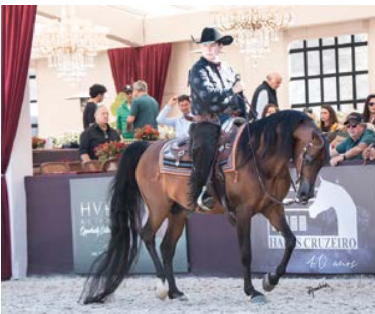
Champion Western Open - Royal Kabanga