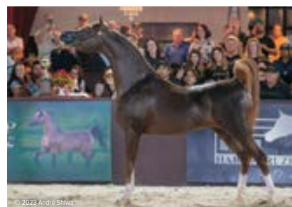
Silver Stallion - Abbas Al Ventur