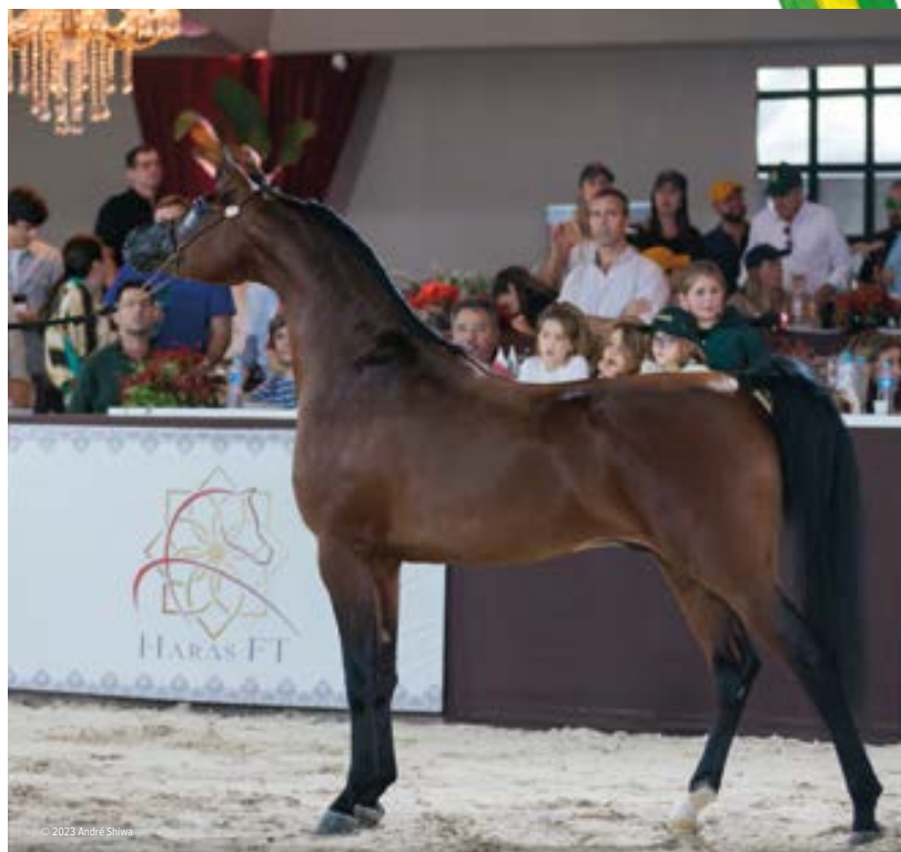
Gold Young Stallion - Opus One Arabco II

The Senior Mare Championship brought some strong show-winning veterans back to the ring. After a strong competition the refined grey RFI Sawari, a daughter of Excalibur EA and RFI Sophie Al Maktub, emerged victorious. Following her was the beautiful bay