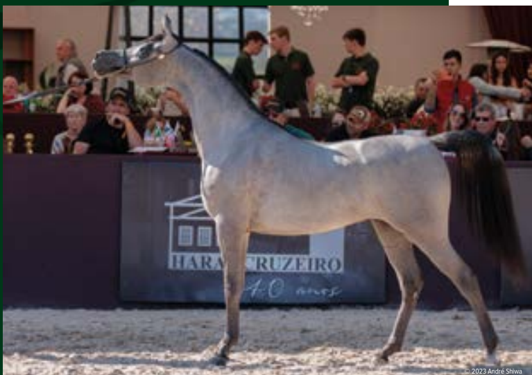
Gold Young Filly - FT Simphonia