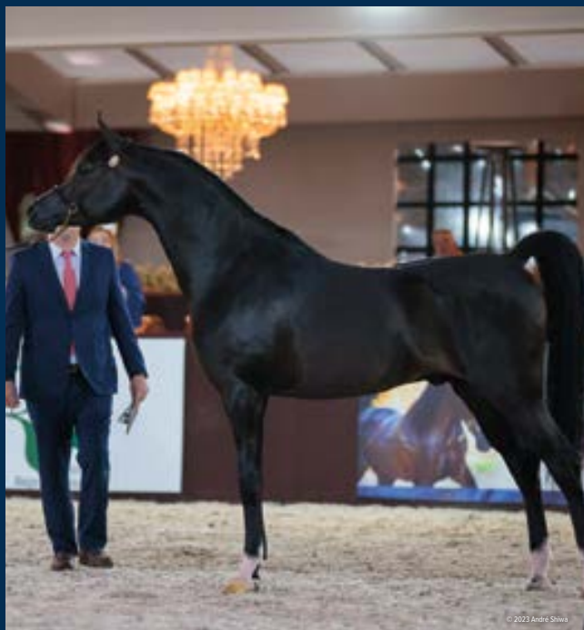
Gold Stallion Brazil Cup - Fuego Royal JM

Haras JM and owned by Haras el Sevillano. The Silver spot went to Jafar FWM (Prince Valentino FWM x Victoria FWM) bred and owned by Haras Lone Star. The Bronze winner title went to RFI Antares (RFI Farouk al Maktub x AF Leneta) bred by RFI Arabians and owned by Haras Marbelle.