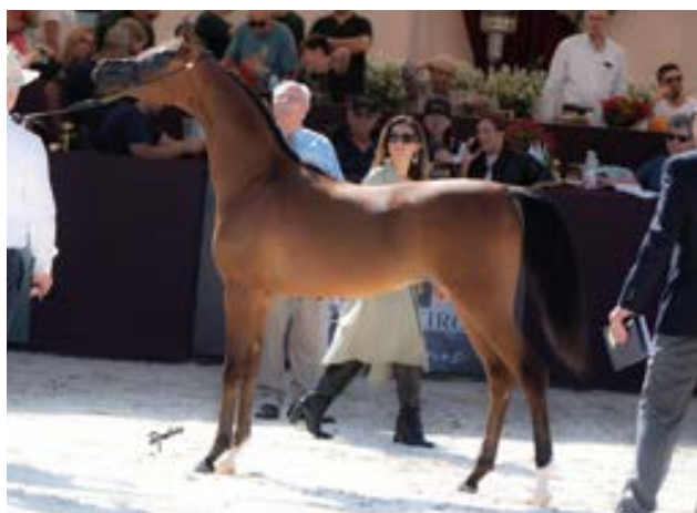
Silver Jr Filly - Himpehrya Terjoi JM