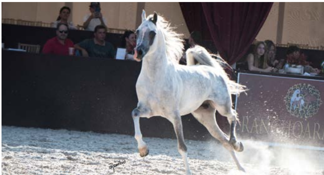
Gold Liberty Class - El Kaiser Ali JM