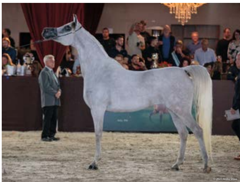
Gold Mare - RFI Sawari

Once again the Brazilian National Show was a big success, a true testimony to the hard work done by the entire ABCCA ensemble. We look forward to next year's edition and will cherish the memories of the magic days spent last July at the Helvetia Riding Center. May next year be as wonderful as this one. Though it will be a tough task to accomplish. See you all in July 2024 for yet a new edition of our beloved Brazilian National Show.