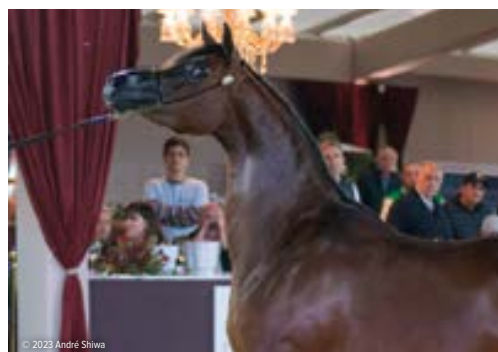
Silver Young Mare - Ultraah Serondella