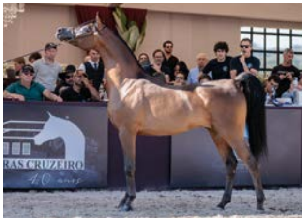
Silver Colt - Maximillion NA