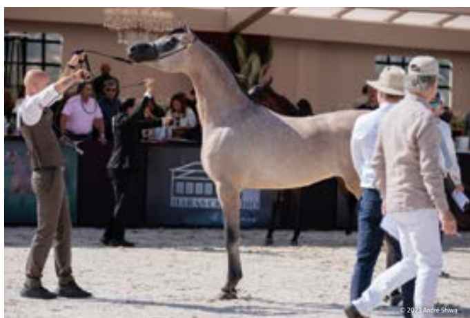
Silver Young Colt - Destiny HEC