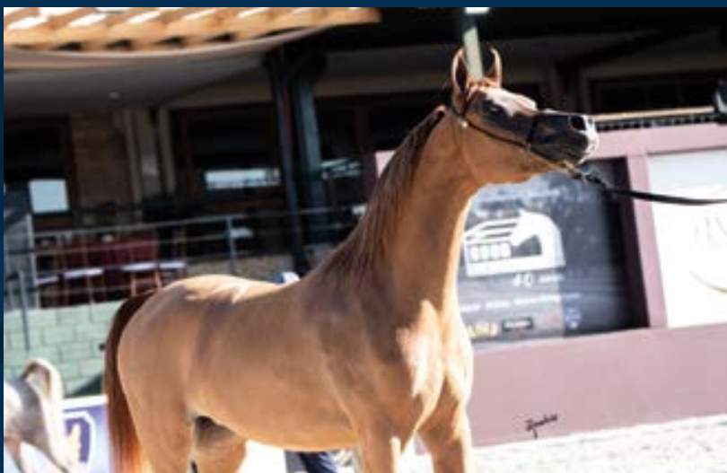
Gold Filly Brazil Cup - Pimpinara Rach