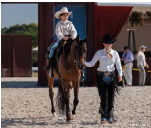
Western Lead Line

The traditional Western Pleasure classes are usually the most popular of all the performance classes in Brazil. This year they were divided in: Maiden, Young Horses, Senior Horses, Exhibitor class and Open class.