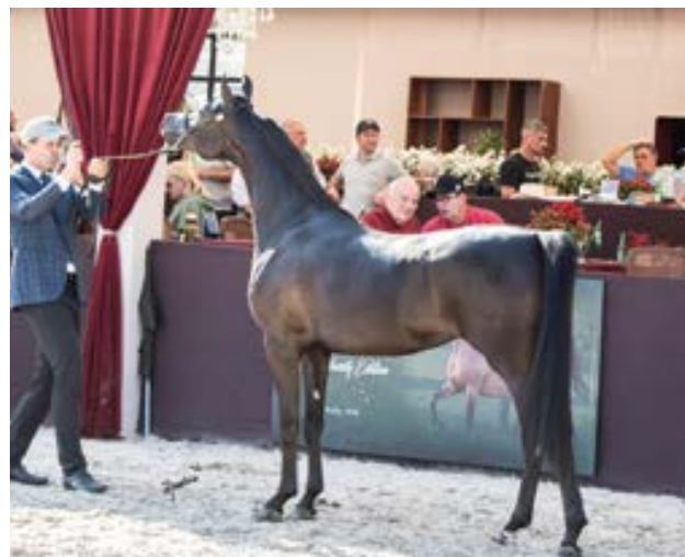
Bronze Young Filly - Verdadeira Rach