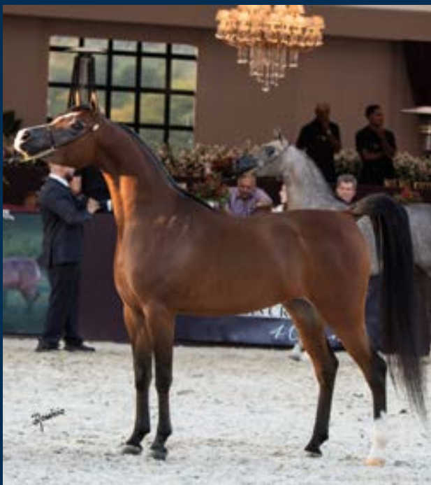
Gold Mare Brazil Cup – VV Yasmin

turn is by the Versace son DA Valentino out of Alaya REC. She was bred by Haras Brown River and is owned by Miluna Arabian Horse. And finally the Bronze Champion Mare Ezzoticka JM is by the Versace son *Thee Aprentice and out of Ydivine di Fames JM who in turn is out of Divine NVC a mare that the represents one of the most successful mare families of Haras JM, who bred and owns Ezzoticka, being also the mother of the Brazilian National Champion Mare Pietra di Style JM.