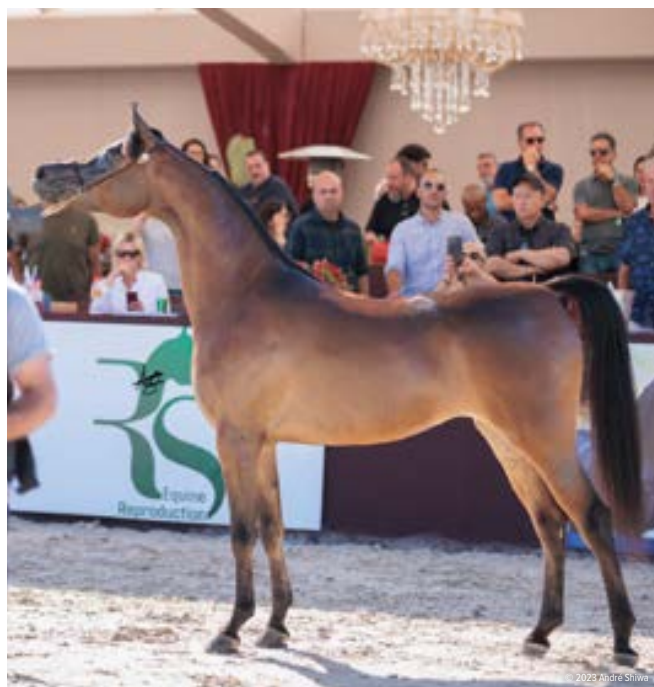
Gold Filly - HT Lunatica