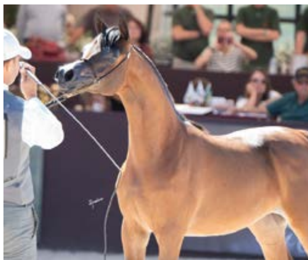
Bronze Jr Jr Filly - Almaah Serondella