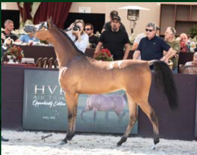
Silver Young Filly - Karmela LA

A competition of beauties took the ring during the Young Filly Championship. The emerging victorious filly, though silver in color took home the Gold. FT Simphonia is third generation of Flavia Torres breeding, having National Champion Mare Sophia el Bogart as her paternal grandmother and FT Saeed as her father. Following her came the very feminine Karmela LA, a daughter of EKS Farouk and Gazala LA, bred and owned by Haras Cruzeiro. The black beauty Verdadeira Rach, from Rach Stud, who is by Bandit SRA out of the iconic black beauty Vaidosa Rach ended up with the Bronze.