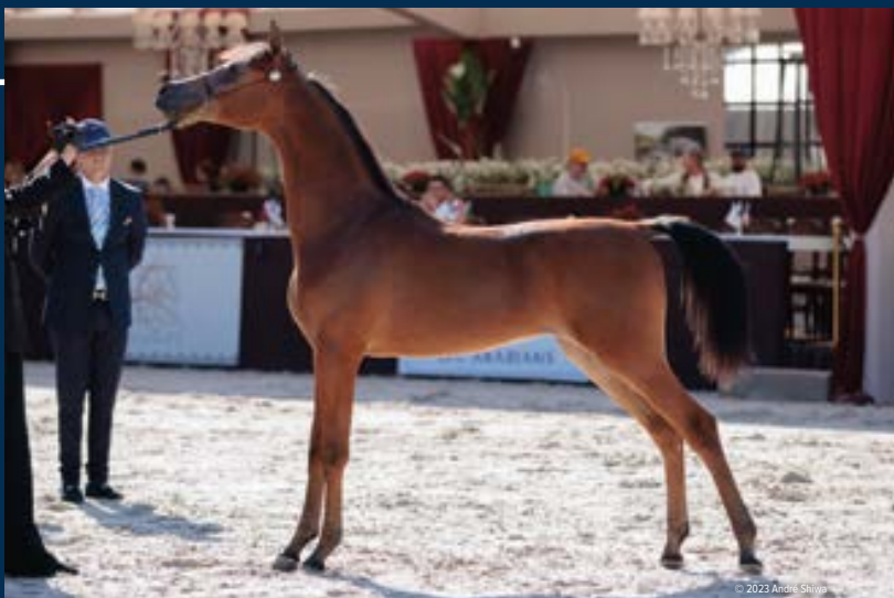
Gold Junior Colt Brazil Cup - Sir Lucius FWM