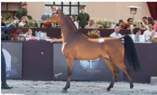
Bronze Young Colt - Gazani JSZ

The Young Colt division was won by the typey Keanu LA, bred and owned by Haras Cruzeiro. He is also by EKS Farouk and out of Brasilia LA. In 2022 he was named Brazilian National Champion Junior Colt. Destiny HEC, bred and owned by Haras HEC took the Silver this year. He is by Jytan Meia Lua out of Mars Princess HEC. Gazani JSZ by the illustrious Gazal al Shaqab and National Champion Sahara Gallina, bred and owned by Haras Santa Marta, was the winner of the Bronze.