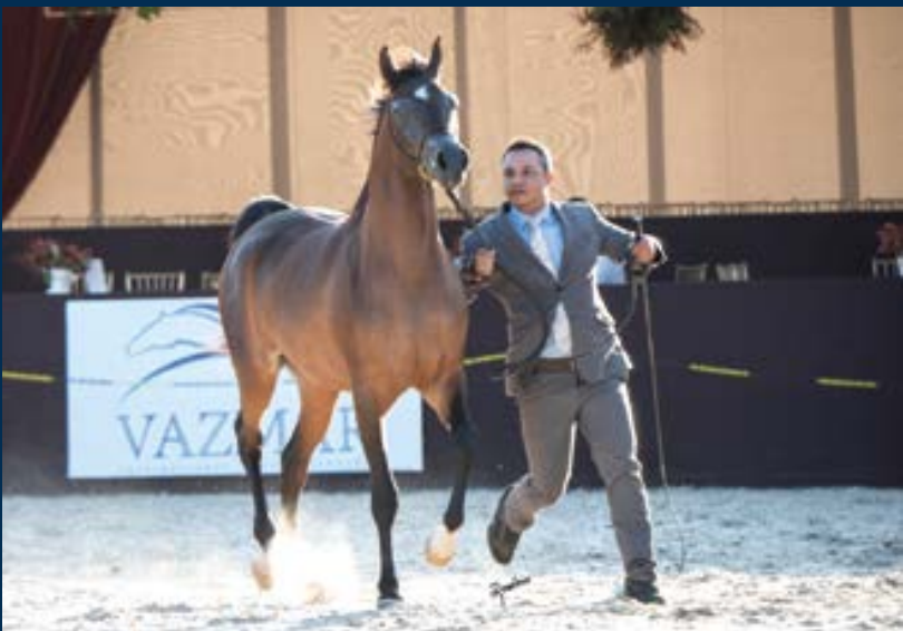
Gold Colt Brazil Cup - Garddian Del Tino JM