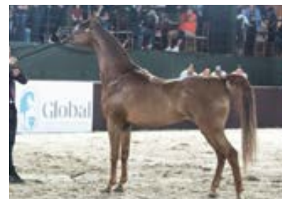
Bronze Mare - Special Dream HVP