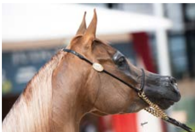
Gold Most Classical Head Female - Hanna LGM