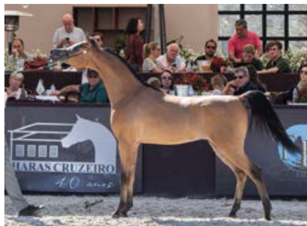
Bronze Junior Colt - EFC Chaheer W