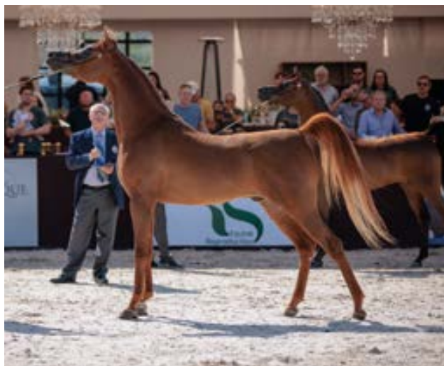
Gold Colt - HK Gran Valehoso

All three of the colt champions had big wins under their belts before coming back to claim for this title. The Gold Championship went to HK Gran Valehoso, a son o