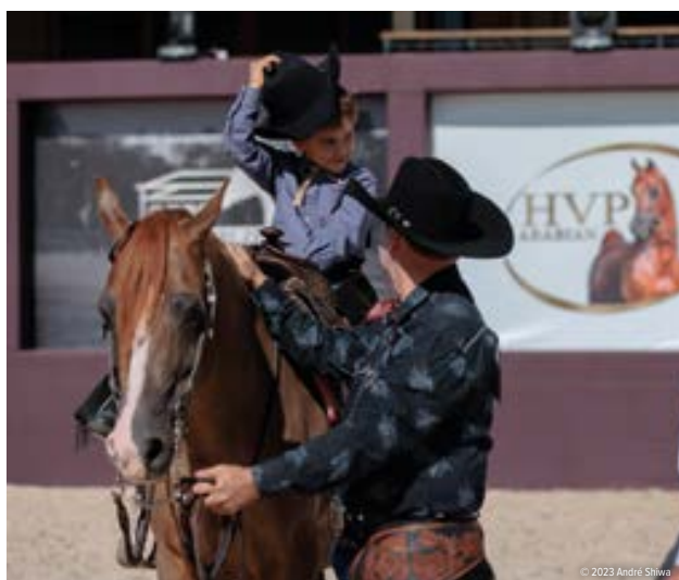
Western Lead Line