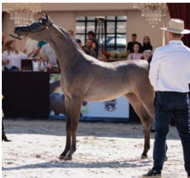
Silver Jr Jr Colt - Domenico FWM