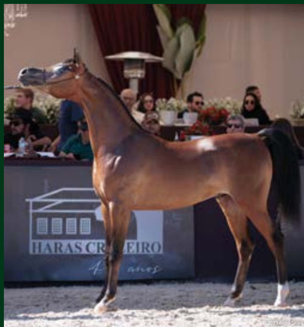
Gold Junior Colt - Thovar HVP