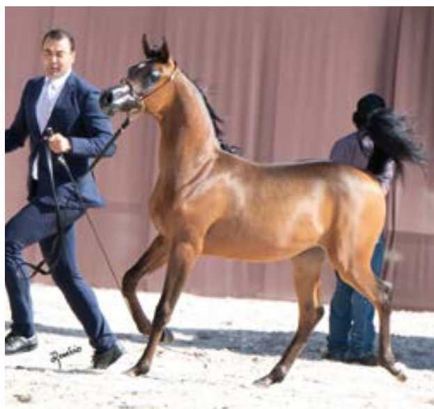
Bronze Jr Jr Colt - Evoke