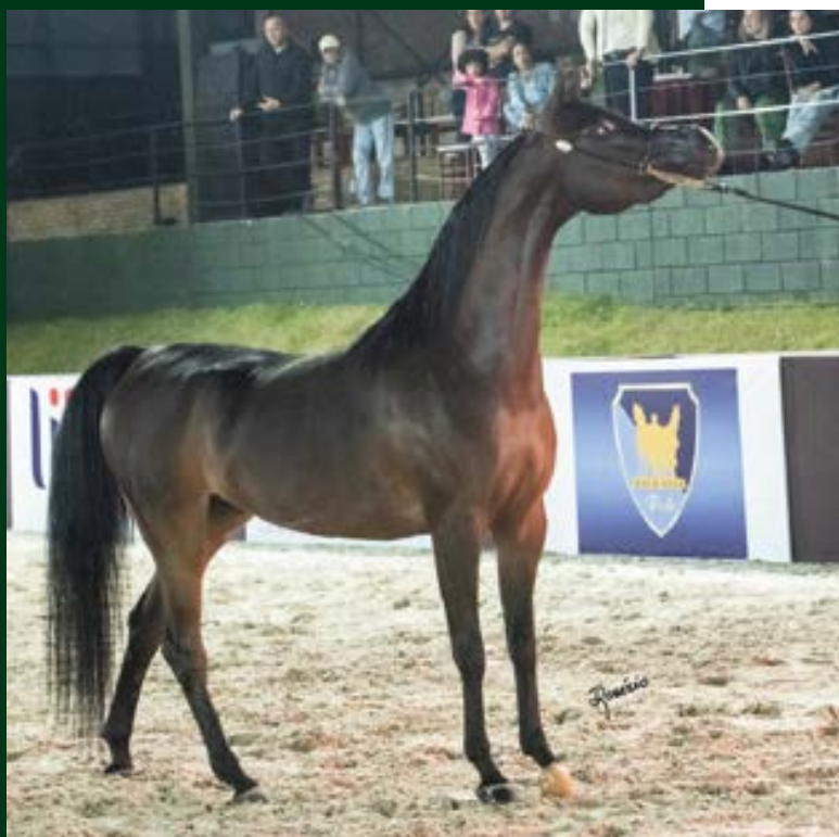
Gold Young Mare - EFC Pillar