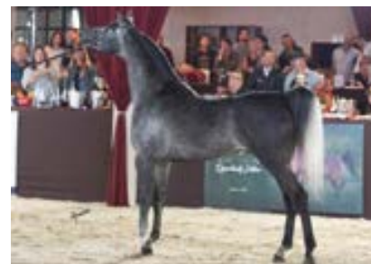
Bronze Stallion - LR Pipistar