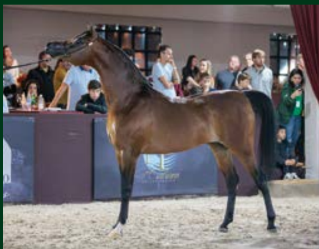
Silver Young Stallion - Royal Destiny