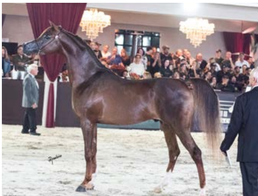
Gold Stallion - Ajmer Moniscione