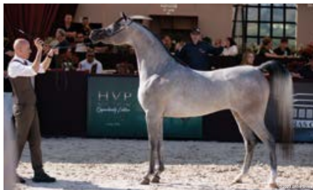
Bronze Filly - Monah HVP

The Filly Championship was arguably one of the strongest in a long time. not only the Championship itself but also the age groups. For us in the audience it was a parade of beauty before our eyes. Many previous champions showed up and gave their best, nevertheless it was a bay filly bred in Argentina and owned by Haras Lonco in Chile that stole everyone's heart (including the judges who gave her the Gold unanimously). I'm talking about the breathtaking HT Lunatica, a statuesque daughter of Dominic M who was not known in Brazil until her entrance and took the show by storm. The Silver Champion is another great beauty that has won the Gold two years in a row before. My Best Surprise FWM is a daughter of Bandit SRA and Nahla el Madan, bred and owned by Haras Lone Star.