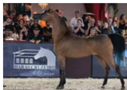
Silver Mare - Felma LA