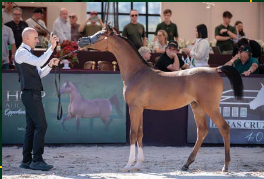
Gold Jr Jr Filly - Aysha EV