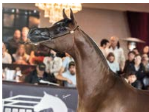
Bronze Young Mare - Rhona Vul do Divino