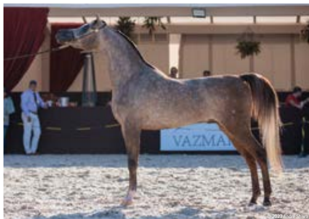
Bronze Colt - Kamal Ali HEC