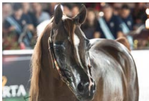
Gold Most Classical Head Male - Ragnary GV