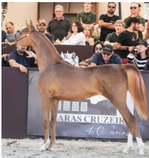
Gold Jr Filly - Acqua Serondella

The Junior Filly Champion has created quite a fan base for her. Considered one of the all time favorites born at Haras Serondella, Acqua Serondella dazzled the audience with her beauty, graceful movement and structure. Her father Abbas al Ventur became the Silver National Champion Stallion of the show. Her mother Samoah Serondella, a Brazilian Top Ten mare, is a daughter of the iconic Only Serondella and HP Ali. The Silver Jr Filly Champion Himpehrya Terjoi JM is by the Argentinean Stallion HCE Terjoi, who spent two years on lease in Brazil, and out of Alyssa Crystal RLC by Vulcano HVP. The Bronze prize went to Haras das Faias and their homebred HDF Fantastica by the DA Valentino son of Bandit SRA out of Thora Serondella.